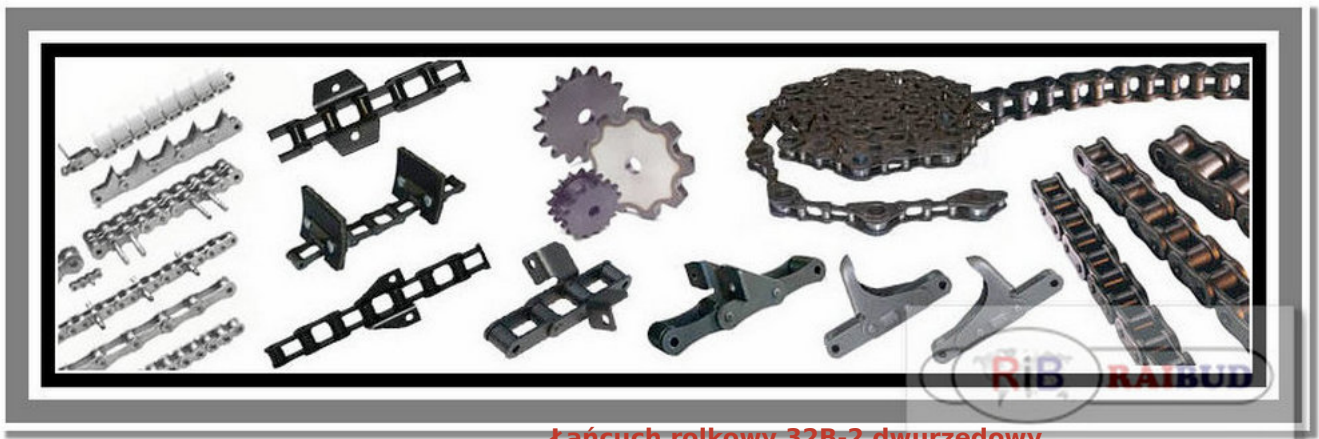
Łańcuch rolkowy 32B-2 dwurzędowy