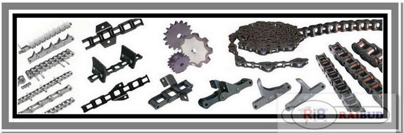
Łańcuch rolkowy 16B-1